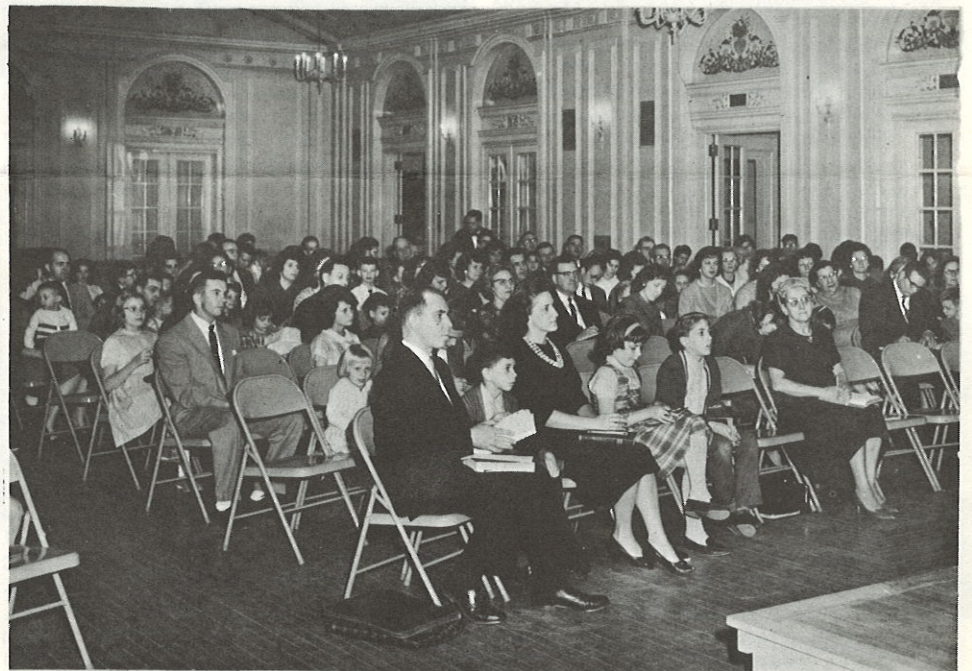
Akron Bible Study