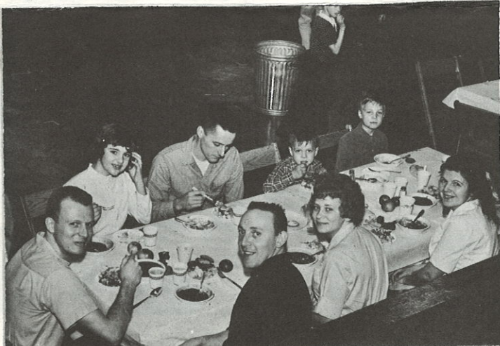
Enjoying fellowship God's way,